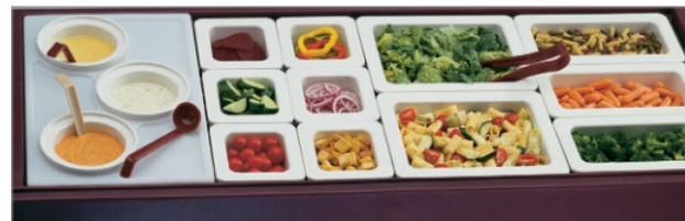
Ideal for use with Cambro Versa Food Bars® to keep perishable items chilled.